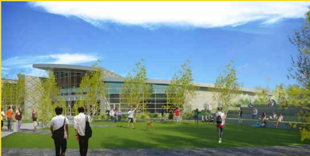
View of Central Courtyard