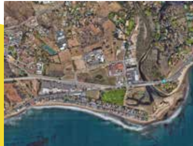
6. Malibu's majestic physical environment