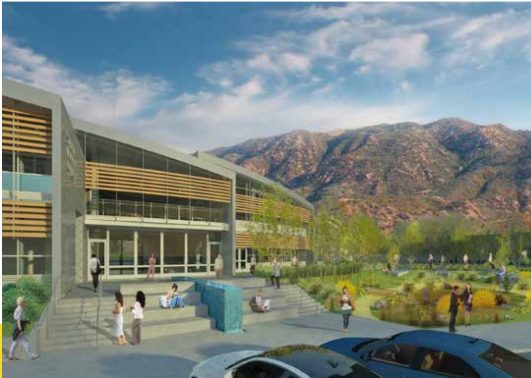
View of Main Entrance