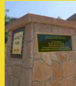
8. A proud donor to Legacy Park

1. A sea stack glows red at El Matador State Beach, just one of the jewels of Malibu's many public beaches and parks along its 21 miles of coastal beauty. 2. Looking east across Santa Monica Bay to Santa Monica with the giant coreopsis, a treelike shrub native to the Southern California coast as it wakes from its yearly sleep and shines in golden bloom. 3. The Fall 1980 Schedule of Classes featured more than 75 classes offered by Santa Monica College at the former Malibu Park Junior High School on the west end of Malibu and at locations in the Malibu Civic Center. 4. Malibu has fully embraced its status as the epicenter of surf culture. In 2010, Surfrider Beach near the Malibu Civic Center and on the north shore of Santa Monica Bay was named the globe's first World Surfing Reserve. 5. Malibu Creek starts at Malibu Lake and flows 13 miles while descending to Malibu Lagoon. Almost all of the Malibu Creek watershed falls within the Santa Monica Mountains National Recreation Area. 6. The SMC Malibu campus site is situated in an extraordinary physical environment of scrub sage, chaparral, and elfin forests of oak; a vast watershed ecology; a lagoon, wetlands, and riparian ecosystem; marine habitats; and geological strata. 7. There are more than 140 species of birds found at the Malibu Lagoon along with a diverse wildlife throughout the area. 8. Santa Monica College takes pride in its contribution towards the purchase of Legacy Park.