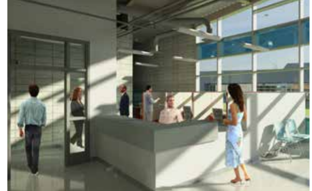
View of Sheriff's Lobby