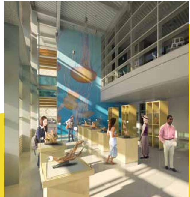
View of Interpretive Center