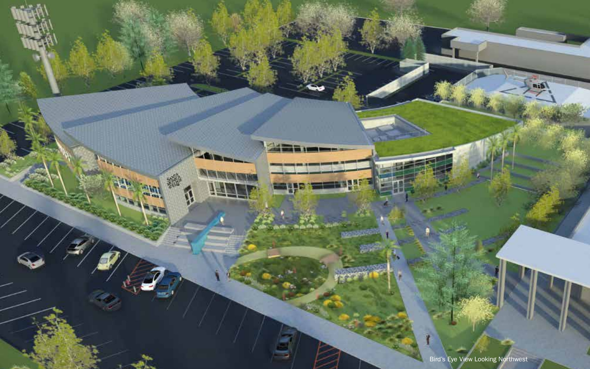
Bird's Eye View Looking Northwest