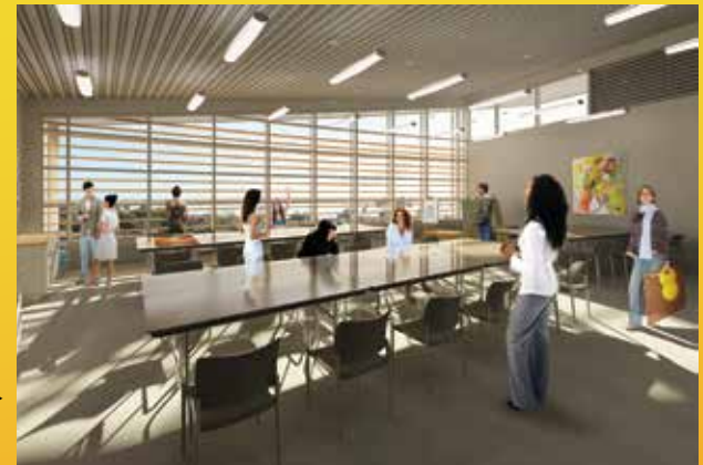
View of Flexible Art Classroom ▶