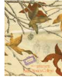
3. 1980 SMC Malibu Class Schedule