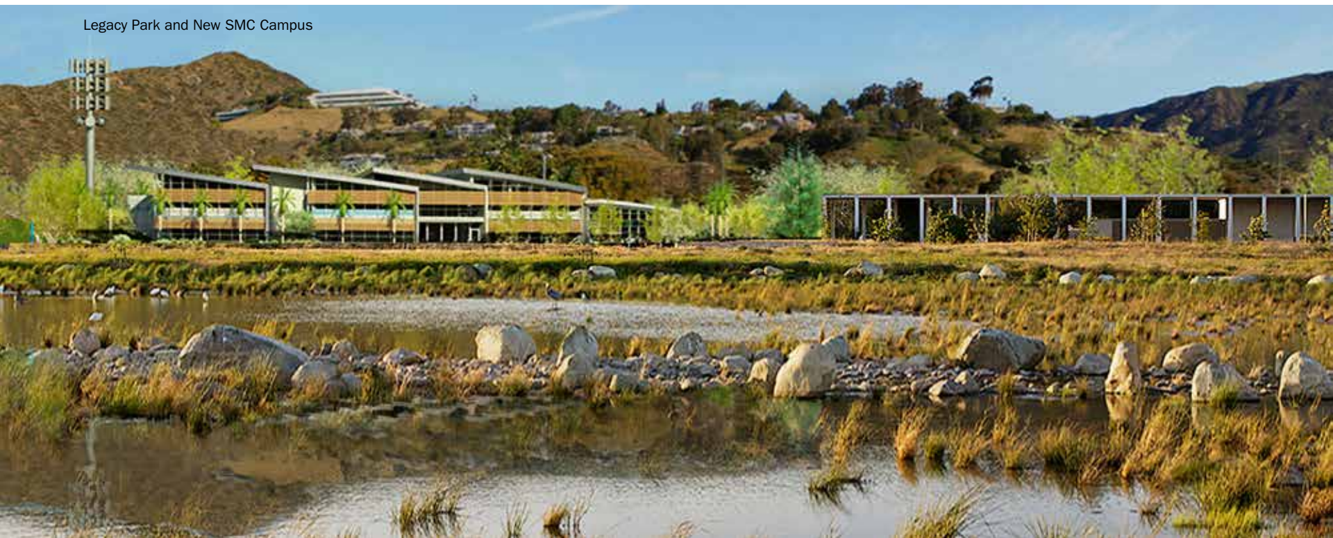
Legacy Park and New SMC Campus