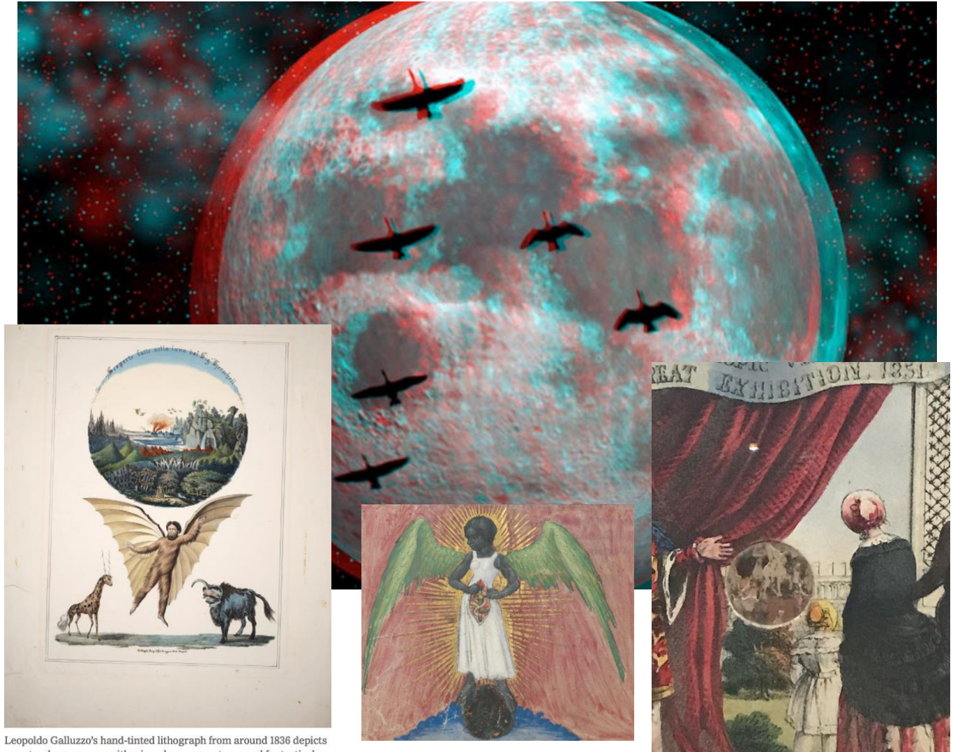
Leopoldo Galluzzo's hand-tinted lithograph from around 1836 depicts a pastoral moon scene with winged man, giraffe, and donkey.

In a traveling magic box theater, a fable unfolds that captures the urgency of lives lived seeking a better world, the quest for a utopia, an escape to a far-off moon where it is believed abundance and harmony might be found.