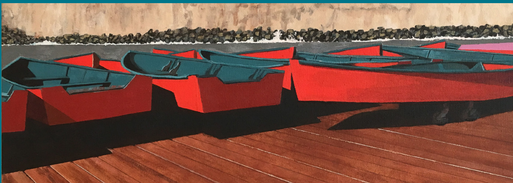
Rebel Clair, Capitola Pier , Acrylic on Canvas, 2017

Cover Paintings are Featured in the Emeritus Gallery Show Student Art Exhibition 2017