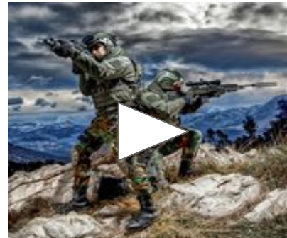
Game Animation Reel**