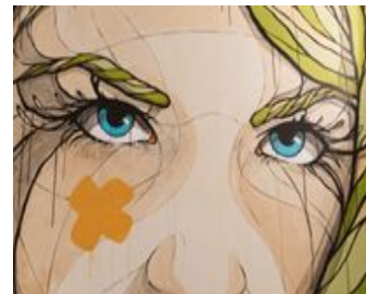
3D Animation Project Title 5*