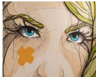
3D Animation Project Title 5*